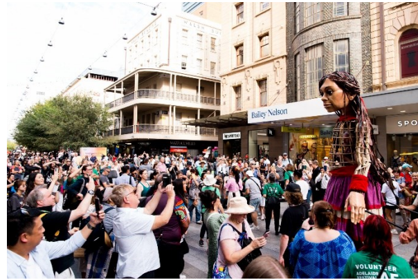
Rundle Mall Foot Traffic

Lunar New Year celebrated the Year of the Dragon. Rundle Mall activated the Precinct with traditional lion dances every hour, on the hour, from 12 pm to 6 pm on Friday 16 February.