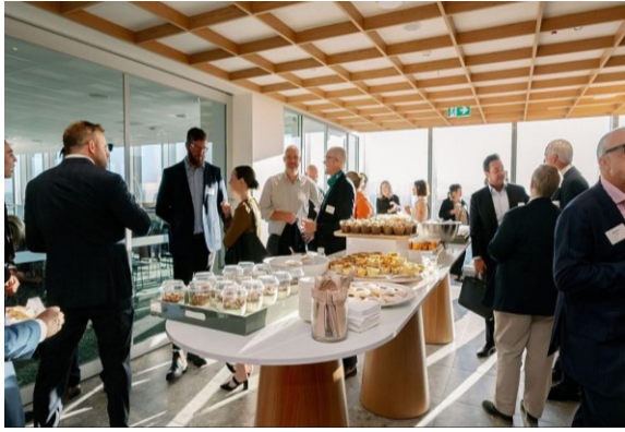
Property Council SA – Office Market Report

AEDA collaborated with the Property Council of SA to brief the property industry on the city's economy and the influence of growing white collar industries on construction and activity levels.