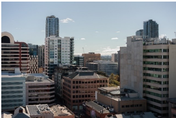
AEDA Reviews Implementation

The business plan was developed in consultation with the AEDA Staff, Advisory Committee, Board, Council Members and reflected the direction of the CoA Strategic Plan.