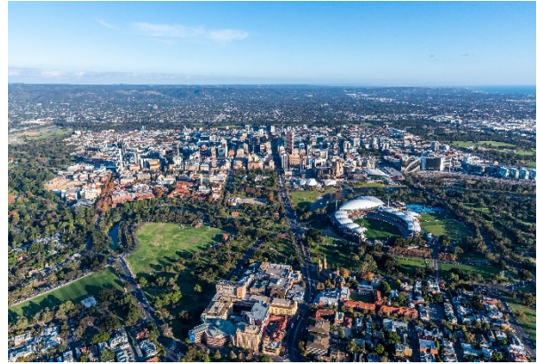
AEDA Business Plan and Budget

The event increased AEDA awareness, promoted Welcome to Adelaide program to various new companies in the CBD including Defence Housing Australia and generated property leads.