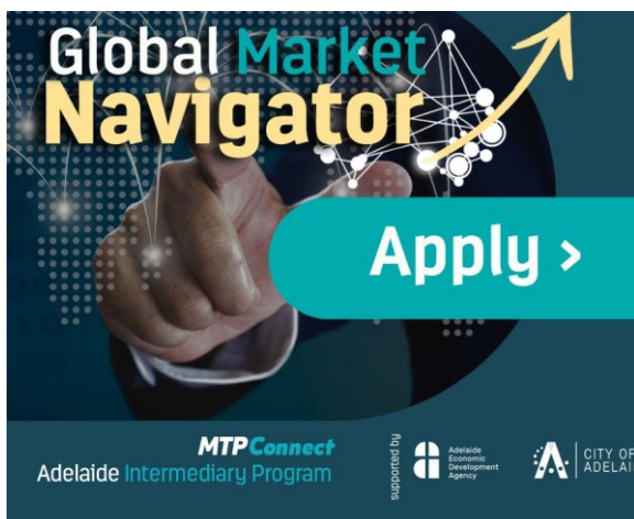
Strategic Partnership Program

The three newly supported Strategic Partnerships have launched their programs: