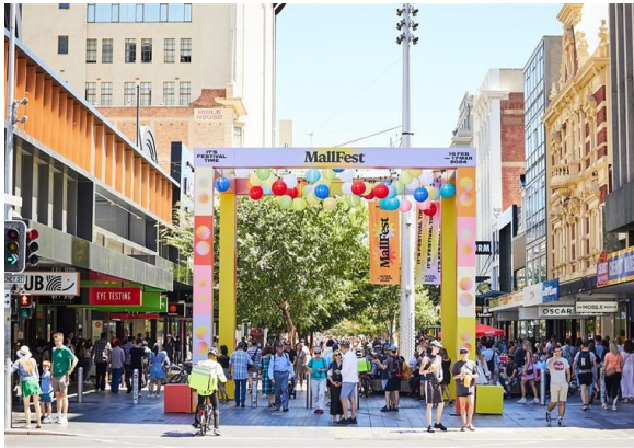
Rundle Mall Activations

Throughout the quarter a range of activations have been delivered in the Rundle Mall precinct increasing vibrancy and driving foot traffic and spend, including: